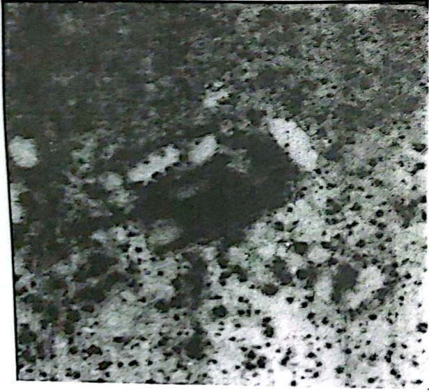
(1) Electron micrographs of BEFV stained with 4% ammonium molybdate X100.000 (bullet, cone shape, Truncated cone shaped particles).