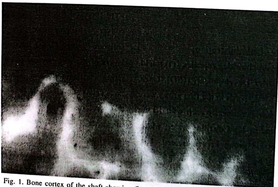
Fig. 1. Bone cortex of the shaft showing fluorescent bands along the lacunar surface, canalicular walls and vascular channels (UV, X 400)

The longer the period of time between termination of tetracycline and sampling, the wider were the bands of unlabelled bone interposed between osteoid seams and the labeled band. Areas of non-specific fluorescence in bone matrix faded 2 days of withdrawal. Formalin solution 10 %, but not freezing, quenched fluorescence by approximately 25 %. Soft tissue, especially the liver and kidneys revealed a faint yellowish fluorescence at the wall of blood vessels one day of withdrawal but not later.