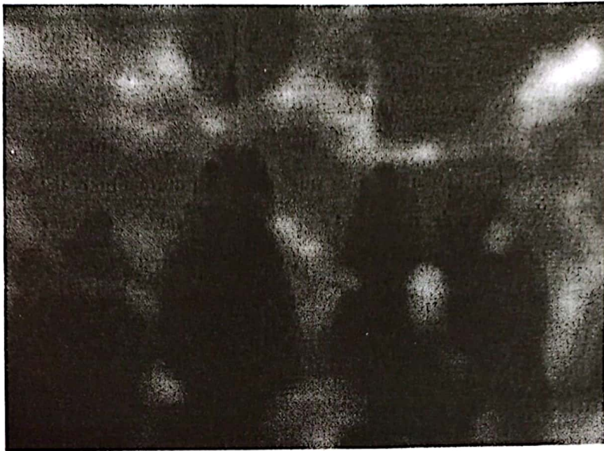
Fig. 2. Metaphysis showing fluorescence of the cancellous bone lamellae (UV, X400)