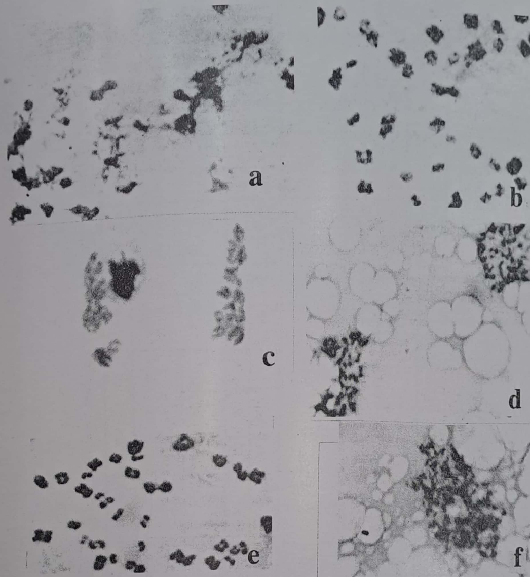
Fig. 2. Chromosome configurations of camel oocytes (x 400).