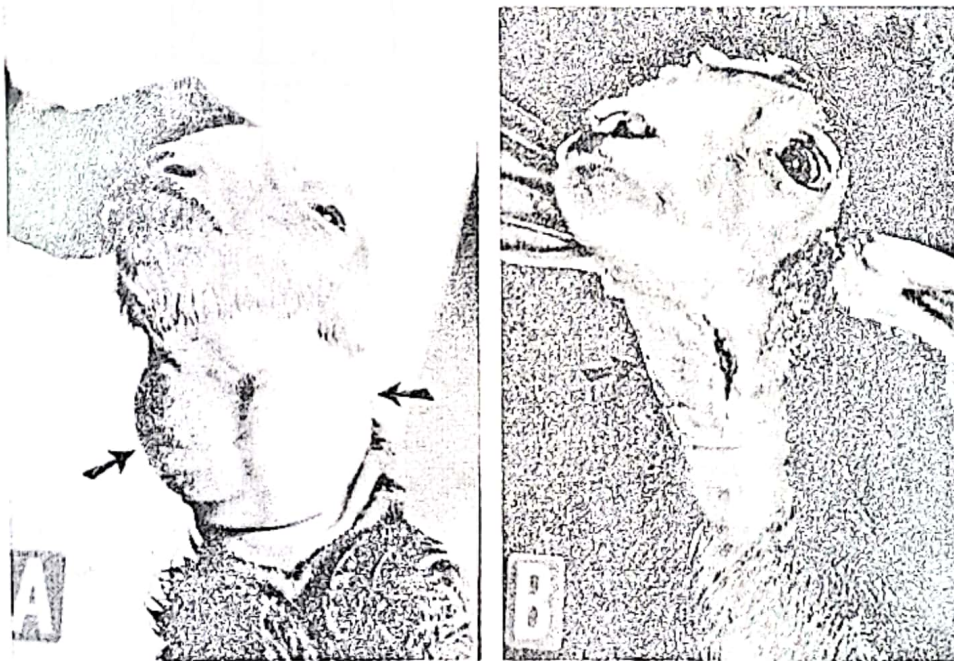
Fig. (2,A): Front view: showing pre-surgical enlargement of the thyroid gland. (B): Lateral view: showing resolution of thyroid enlargement ten days post-hemithyroidectomy.