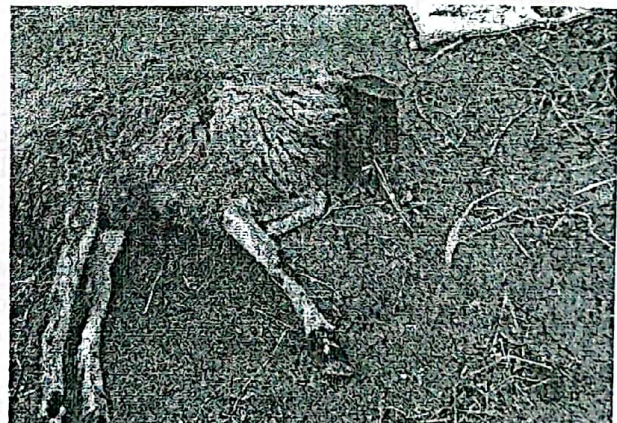
Fig. 2: Sheep in late stage of encephalitic listeriosis, the animal was unable to eat due to facial and tongue paralysis and became recumbent.