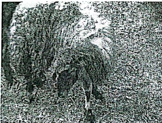
Fig. 1: Sheep in early stage of encephalitic listeriosis, the animal started moving in circles with deviated head and neck.

a Significant difference with b ( P \leq 0.01 ) in the same column and non significant to that marked with a . b Significant ( P \leq 0.01 ) to that marked with a in the same column and non significant to that marked with b . c Bacteriological examination was done in collected faecal samples and/or rectal swabs, 2 weeks post-treatment.